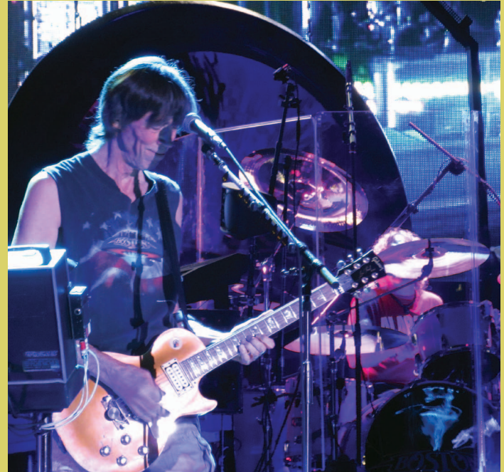
Scholz on stage during a concert in Tuscaloosa, AL, playing his Les Paul guitar.