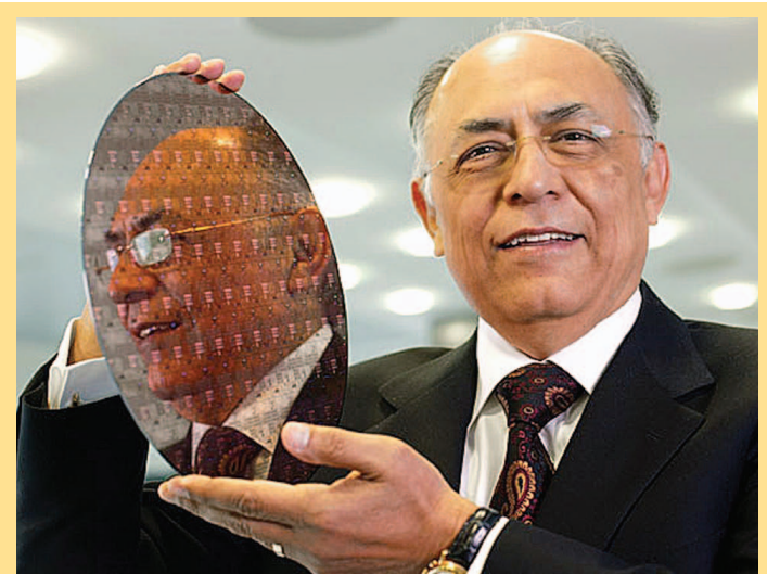
Ruiz, CEO of AMD, holds a 300-millimeter (12-inch) wafer containing 64-bit computer chips, one of the first products produced in 2004 by a new AMD factory just opened in Dresden, Germany.