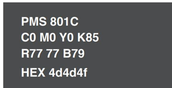
Figure 1 – Official Colors

Font : Myriad Pro Family / Semibold / Regular / Light