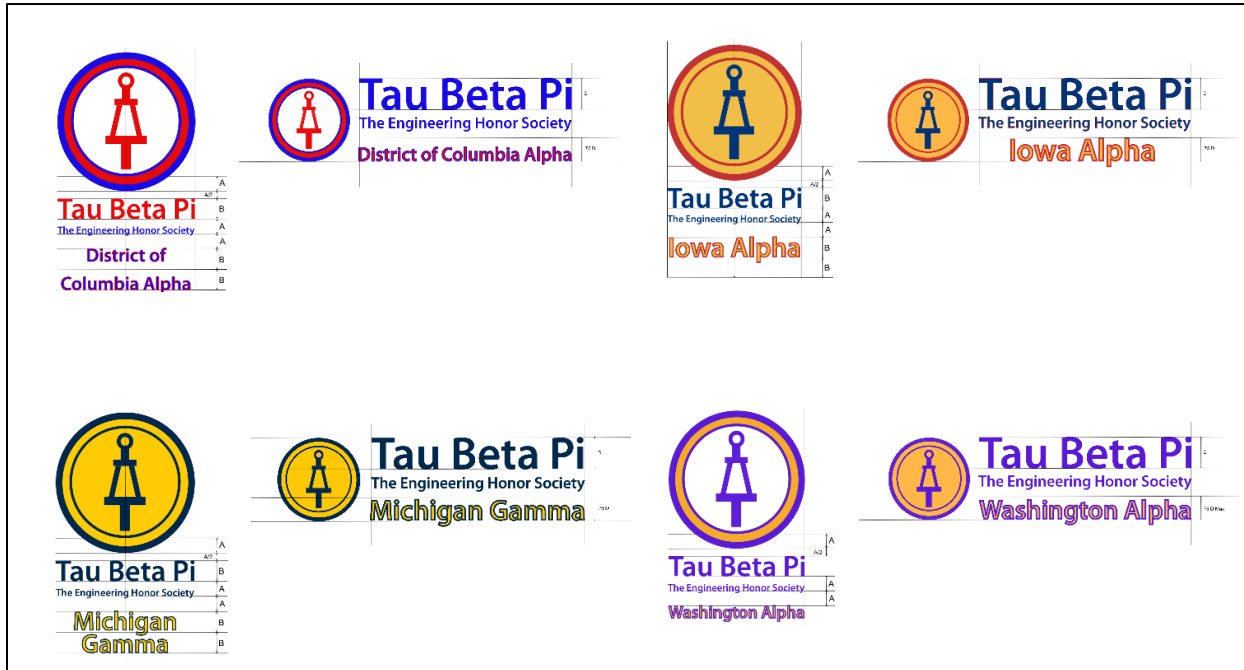
Figure 3 – Chapter Logo Examples

Number: C2019-01 Effective: 12/04/1999 Last Modified: 10/12/2019