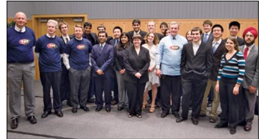
Michigan Gamma Chapter officers and distinguished alumni celebrated the chapter's centennial on April 7-9, 2006.

The 100th Convention of Tau Beta Pi was held in October 2005 in Salt Lake City with Utah Alpha/Beta/Gamma as co-hosts. The meeting was fully reported in THE BENT and THE BULLETIN. The 2006 Convention will be hosted by Colorado Beta in Denver/Boulder. The 2005 Convention approved one amendment to the Constitution and Bylaws of the Association, which was ratified by Executive Council vote for invalid and non-voting chapters: to revise the duties of the trustee. The 2005 Convention: amended Bylaw V to require initiation fees to be payable within two weeks instead of 10 days and to allow chapters to remove an elected officer for cause; decided to use the standard reimbursement schedule for the 2006 Convention; approved 11 appealed programs, denied five, and committed two to the 2006 Convention; accepted no invitation to host the 2007 Convention;