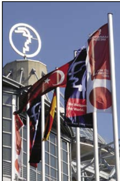
Figure 5. Hannover Fair attracts more than 6,400 exhibitors from around the world.

The fish was back in 2007, powered by pneumatic muscle that contracts as its diameter swells to generate power. Festo also unveiled a pneumatically controlled string quartet and drum that played at the opening ceremonies. There was a Mylar dirigible modeled on a manta ray that moved by flapping its wings. It bobbed above the crowd until it crossed a ventilation system downdraft, crashing into the people below.