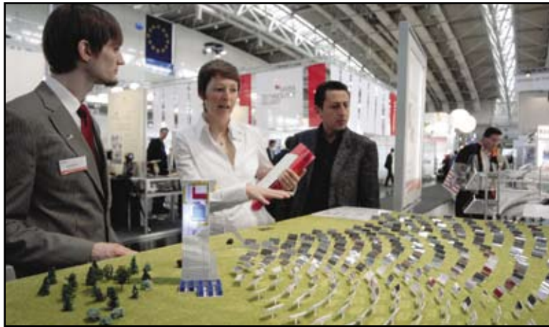
Figure 6. The research and technology exhibits are always crowded. They offer a chance to see the new technologies from startups, schools, government laboratories, and established companies.

Yet any increase is a triumph in an age when engineers can download specifications, user guides, case studies, and application information off the Internet. Hannover