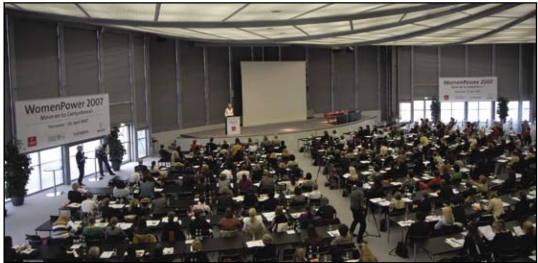
Figure 4. Hannover Fair opened with speeches by Germany's chancellor and prime minister. Silvana Koch-Mehrin, chair of the European Parliament's Free Democratic Party, opened the women-power symposium.

In many ways, Singh was the ideal guest.