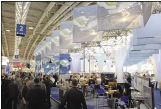
Figure 2. For a few days every April, the sprawling Hannover Fair becomes a small city. This past year, it attracted 240,000 visitors, equal to the population of Baton Rouge or Jersey City.

Ultimately, the fair's 1,300 exhibitors attracted 736,000 visitors, most from Hannover and the surrounding region. It greeted them with sardine sandwiches, a small luxury in a nation that would continue to ration food for two more years. Although exhibitors were not supposed to sell locals any of their consumer goods—textiles, clothing, pots and