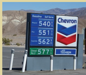
Pump prices on March 28, 2011, in Furnace Creek, CA.