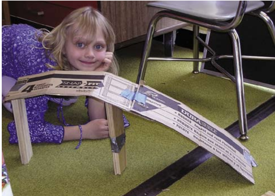
A student proudly displays a ramp designed and fabricated as part of the new curriculum aimed at teaching engineering skills to students in elementary, middle, and high schools.

That meant building on existing science lessons. Start-