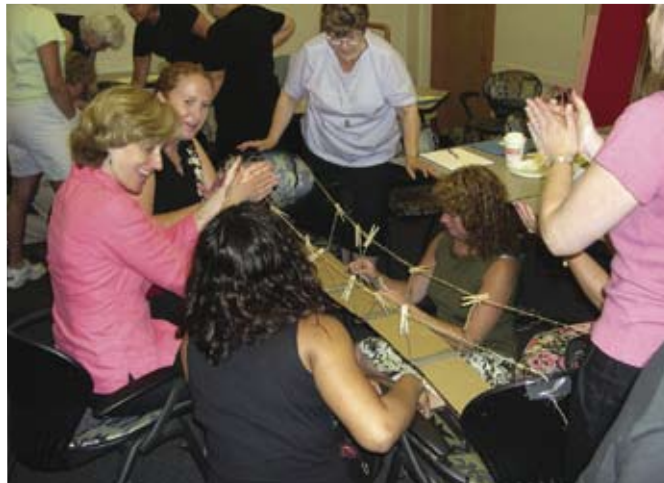
The passive use of packaged experiments is gone. The new curriculum challenges teachers as well as students because there is no single "right answer."