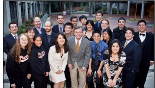
District 15 leaders gathered in Santa Cruz to enjoy the installation of California Alpha Delta Chapter on March 8, 2008.

The 2007 Convention: approved one amendment to the Constitution and Bylaws of the Association, which was ratified by the chapters, to clarify the proof of eligibility of graduate students; decided to use the standard reimbursement schedule for the 2008 Convention; accepted three appealed