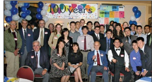
California Alpha Chapter officers and distinguished alumni gathered to enjoy the celebration of the chapter's centennial on April 21, 2007.

The 2006 Convention: amended Bylaw I to require initiation fees to be payable within two weeks instead of 10 days and Bylaw V to allow chapters to suspend an elected officer for cause; decided to use the standard reimbursement schedule for the 2007 Convention; accepted 28 appealed programs, but denied six; accepted the invitations from California Lambda and Upsilon to host the 2008 Convention and from New Jersey Beta to host the 2009 meeting; approved the Director of Rituals having full control over the design of the initiation equipment as long as it operates according to Convention directives; made recom-