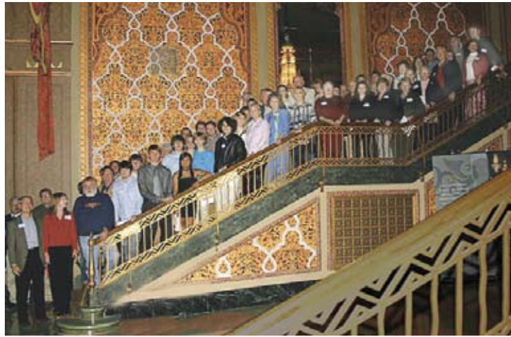
Great Smoky Mountains Alumnus Chapter and Tennessee Alpha members enjoyed dinner and a guided tour of the renovated Tennessee Theater on May 3 of this year.

During the year, about 28,900 engineering students in the 229 Tau Beta Pi chapter schools were scholastically eligible for membership in the top one-fifth of their senior or the top eighth of their junior classes. About 42.8% of these were members of Tau Beta Pi at the close of the year, up slightly from 42.5% the pre-